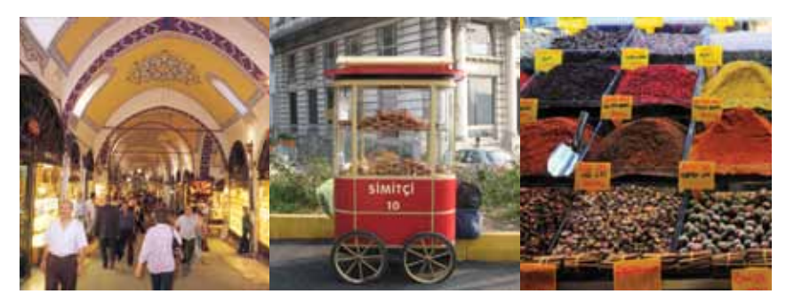
Istanbul is famed for its bazaars, including the Grand Bazaar, and its tasty food from spices to sweets

world's largest diamonds. A stroll through the palace gardens leads to Hagia Sofia. Built by Emperor Justinian, the Church of the Divine Wisdom served as the city's chief mosque for five centuries following the Ottoman conquest in 1453. Staring up at the magnificent domed ceiling decorated with 30 million gold mosaic tiles you understand why Emperor Justinian said, "Solomon, I have surpassed thee!" when he inaugurated the building in 537.